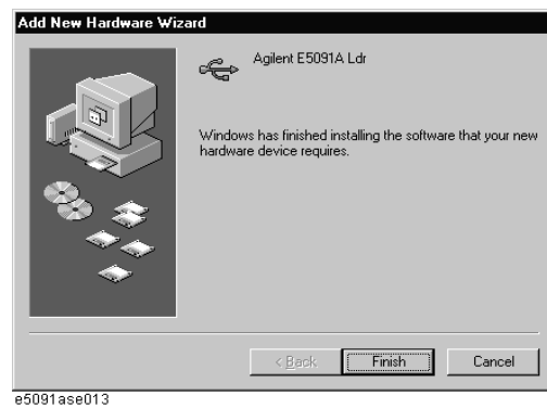
Figure 5 Add New Hardware Wizard (Finish)