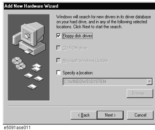
Figure 3 Add New Hardware Wizard (Location Selection)