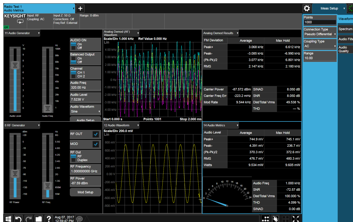
Figure 2. N9093EM0E Example Receiver Test Mode