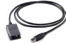
U5481A IR-to-USB cable