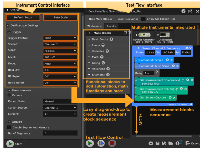
Figure 3. Test Flow Feature Graphical User Interface

Test flow feature enables automated test sequences from multiple instruments. It has an easy-to-use drag-and-drop graphical user interface to create measurement blocks without the need for programming. There are functional blocks to add various instructions, math functions, advanced tools and more, for a truly automated measurement system. Results tab to preview test flow sequence or to automatically logs and store actual measurement data. Test flow sequences can be saved in a file for reuse or easy sharing in the lab. A prerequisite to using BenchVue Test Flow is to have all the instruments apps running within the legacy BenchVue platform.