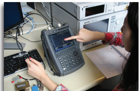
FieldFox redefines RF education.

Using FieldFox, you can demonstrate a wide range of RF and microwave concepts such as transmission line theory, AM and FM modulation, and voltage and power measurements, without requiring expensive and heavy benchtop equipment. This means you can easily carry FieldFox around the lab or classroom to get Keysight-quality microwave measurements.