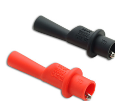
U1162A Alligator clips

For full listing of accessories compatible with U1240 Series, visit www.keysight.com/find/handheld-tools