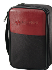
U1174A Soft carrying case