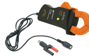
U1583B AC current clamp