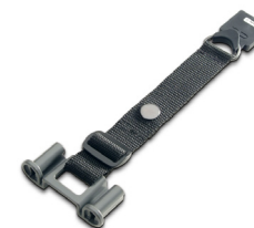
U1171A Magnetic hanging kit