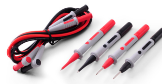
U1169A Test probe leads