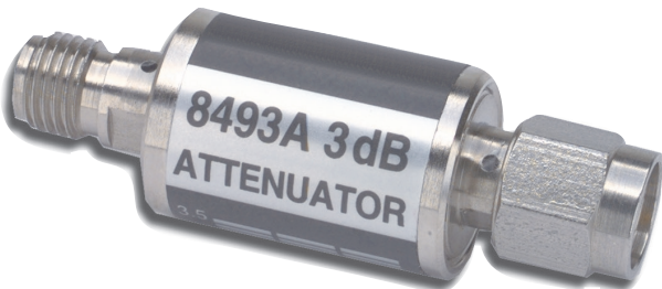
8493A Coaxial Fixed Attenuator