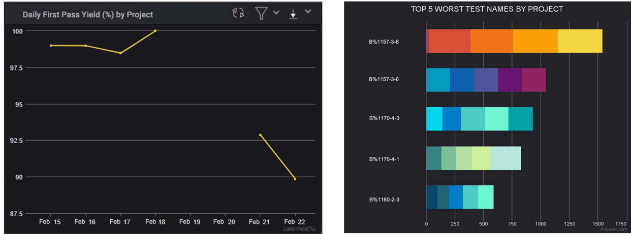
Figure 3. Daily FPY by project and corresponding worst tests for each project to help drive investigations into the failures.

The simple task of just viewing an alert and its corresponding measurement data allows investigators to eliminate the possibility of product failures in just a few clicks. This allows the user to focus on resolving their equipment or product issues rather than spending large amounts of time collecting data, analyzing, and debugging those issues.