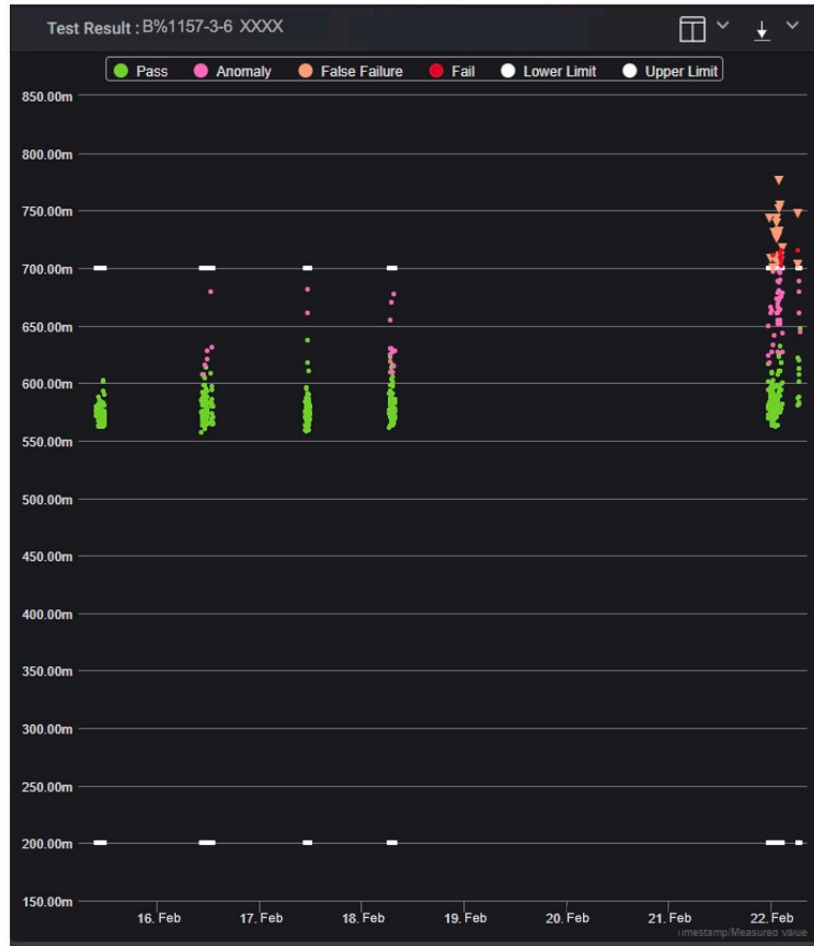
Figure 2. Corresponding measurement chart showing the eventual failures that affected the FPY as the volume of anomalies started to rise on 18-Feb and started to fail on 22-Feb (triangles show the retest passing boards).

From Figure 1, there was a degradation anomaly alert triggered for the fixture F-1234 B123. Looking at the detailed measurements across the week, it shows an eventual failing trend with many failures and failing tests happening on 22-Feb. The failures caused the sharp drop in the daily FPY as shown in Figure 3.