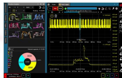
Anomalous Waveform Analytics