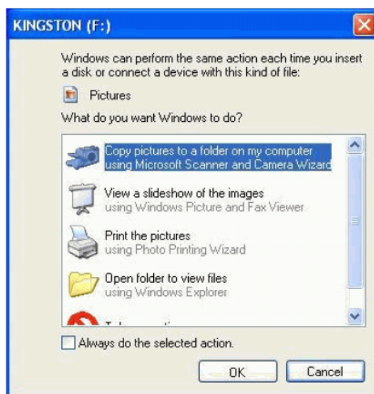
Figure 1 USB Storage Device Configuration Menu